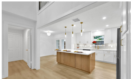
Modern, open-concept kitchen