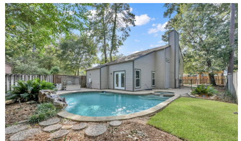
Cozy backyard with a private pool & spa