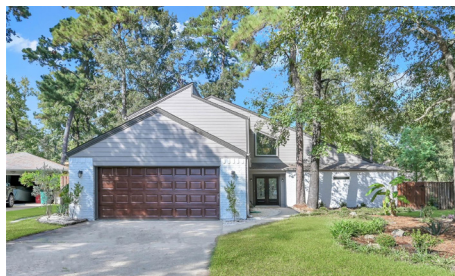
Two-story home with attached garage

Renovated Custom Home situated on a large lot in the quiet neighborhood of Grogans Mill Village, The Woodlands. The Owner's suite is a private retreat lavished with luxe touches that include a huge walk-in shower and vanity with dual sinks. The gourmet kitchen features new LG Stainless Appliances, Custom Sink, Quartz Countertops and Island, new Cabinets with undermount lights. Outside find a putting green, seating areas, and a pool/spa.